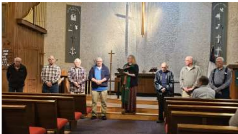
Recognition of Veterans November 10, 2024