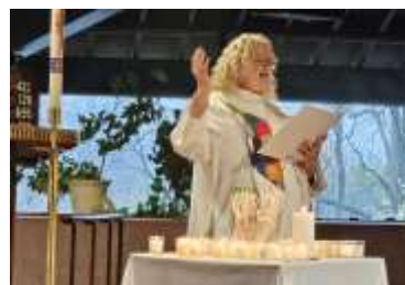
All Saints Sunday November 3, 2024